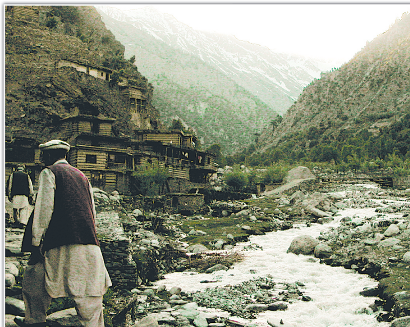
The village of Shekhanandeh clings to a mountainside near Pakistan's border with Afghanistan