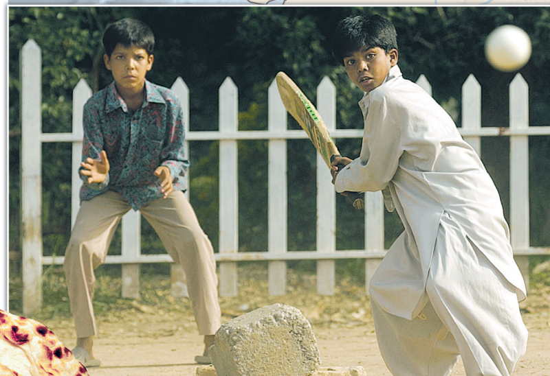
Children play cricket – a passion in Pakistan – in a park in Islamabad

10 About 200,000 Pakistani-Americans live in the United States; New York City has the largest population of about 35,000