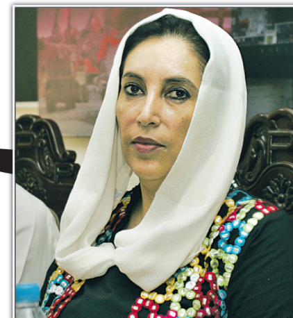
Former prime minister Benazir Bhutto returned in Oct. from eight years in exile; assassinated Dec. 27

13 Zulfikar Ali Bhutto served as president and prime minister from 1971 to 1977; deposed by the military in 1977, he was executed in 1979; his daughter, Benazir Bhutto, led Pakistan 1988-1990 and 1993-1996, but was removed both times on corruption charges; she went into self-imposed exile in 1999; returned Oct. 2007; killed Dec. 27 by a suicide bomber while campaigning for parliament